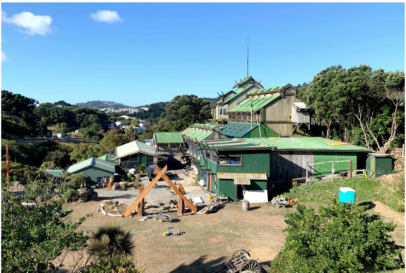
Tapu te Ranga Marae