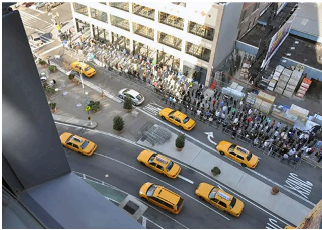
Queue at the Apple Store