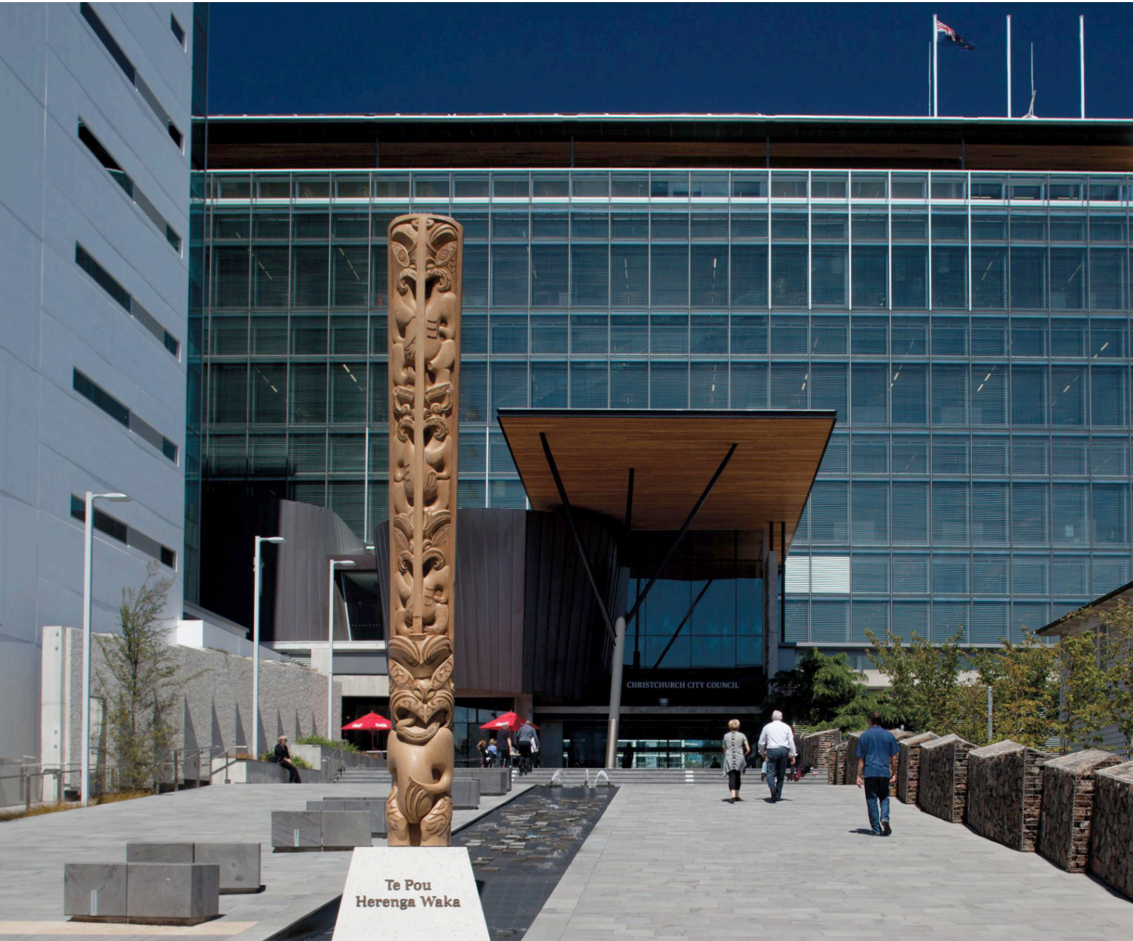
Christchurch Civic Building 16