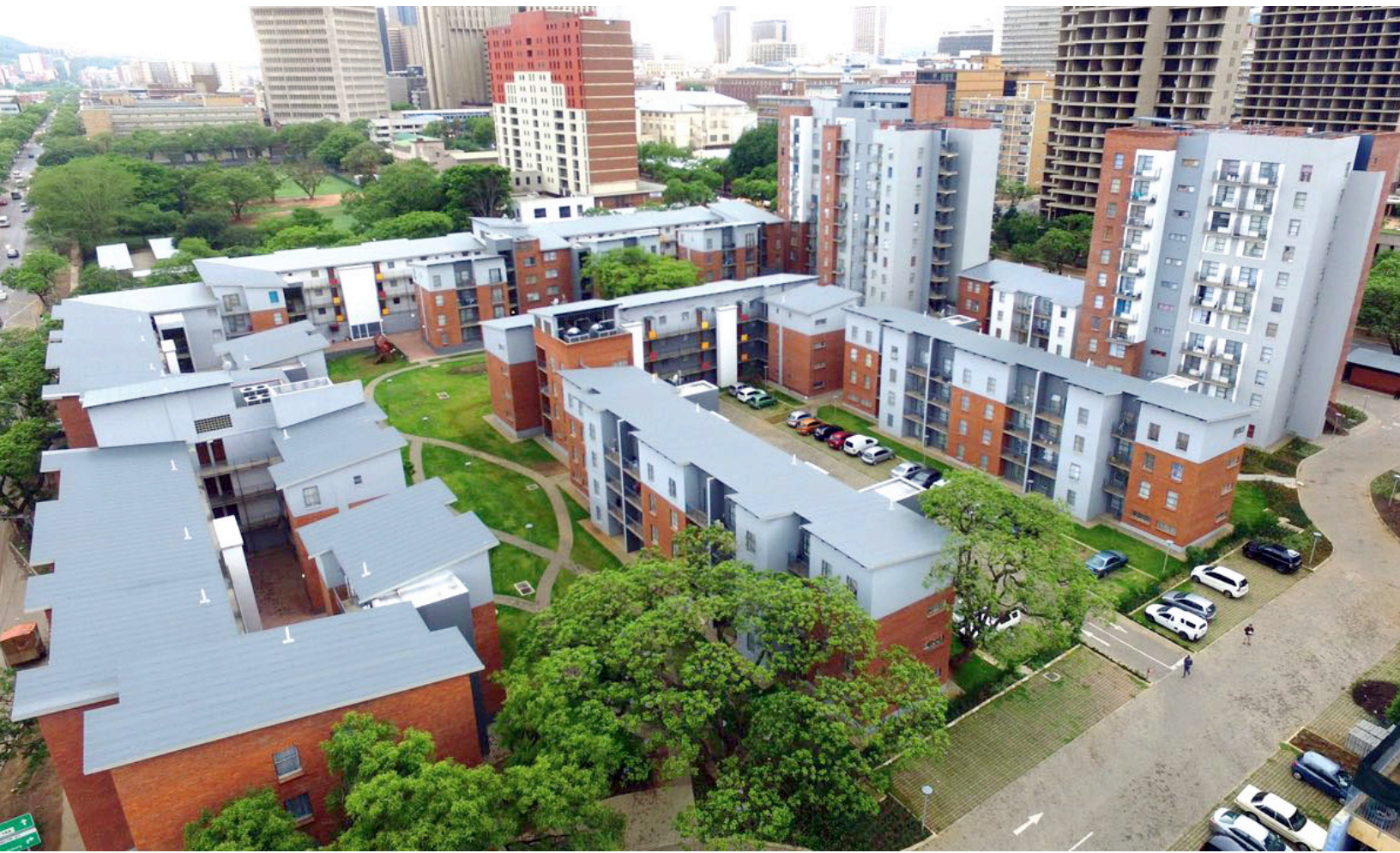
Thembelihle Village Pretoria

eviction of almost 1000 tenants from low-income housing owned by the city, the Yeast City Housing initiative, led by de Beer himself, was begun by six churches in 1998 with the aim of having “a yeast-like effect in the city through strategic investment in special needs and affordable housing, and the restoration of so-called ‘bad’ buildings without displacing people.” 6 From modest beginnings Yeast City Housing has now delivered decent affordable housing to thousands of residents,